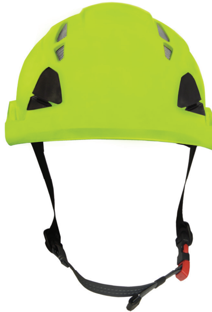
(Front with Chin Strap)