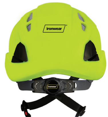
(Back with Ratchet)